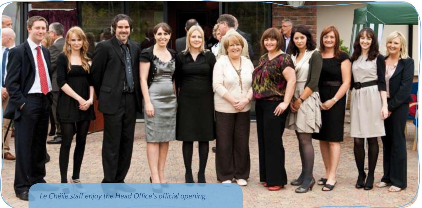
Le Chéile staff enjoy the Head Office's official opening.